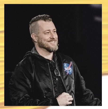
Family systems influencer, musician, writer, speaker, podcast host, and producer with over 30 years of faithbased content.